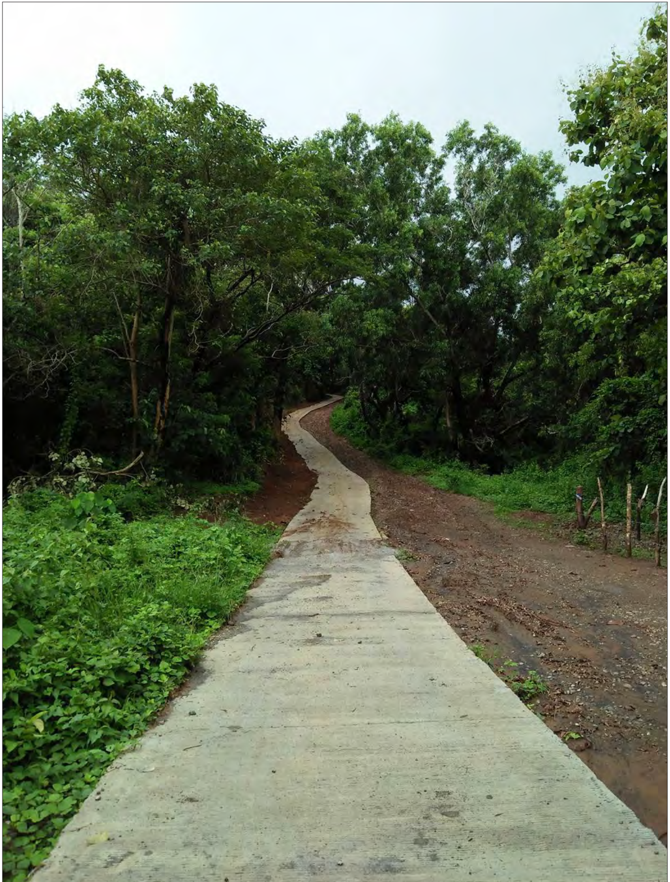
Fig. 7. Ambon-ambon and Lumutan eco-trail. (Binukawan Bicol Marketing Cooperative 2017)