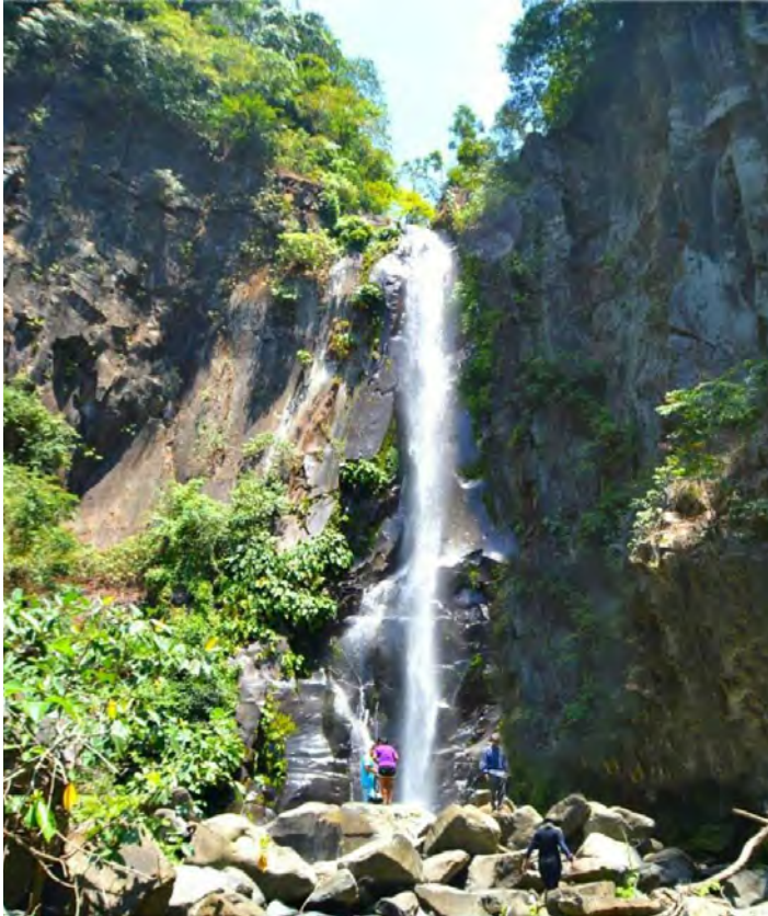
Fig. 4. Ambon-ambon Falls in Bagac, Bataan. (BBMC 2018)