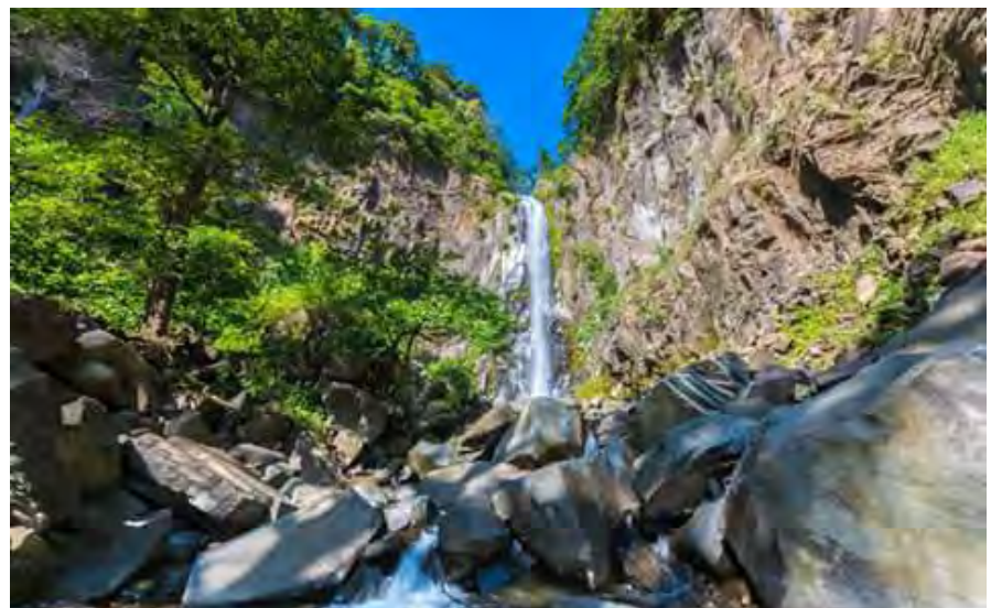
Fig. 2. A shot of the Lumutan Falls in the BNP. (BBMC 2015)

Ambon-ambon and Lumutan Falls are both managed by the Binukawan Bicol Marketing Cooperative (BBMC), while the barangay's local government oversees the Tala River.