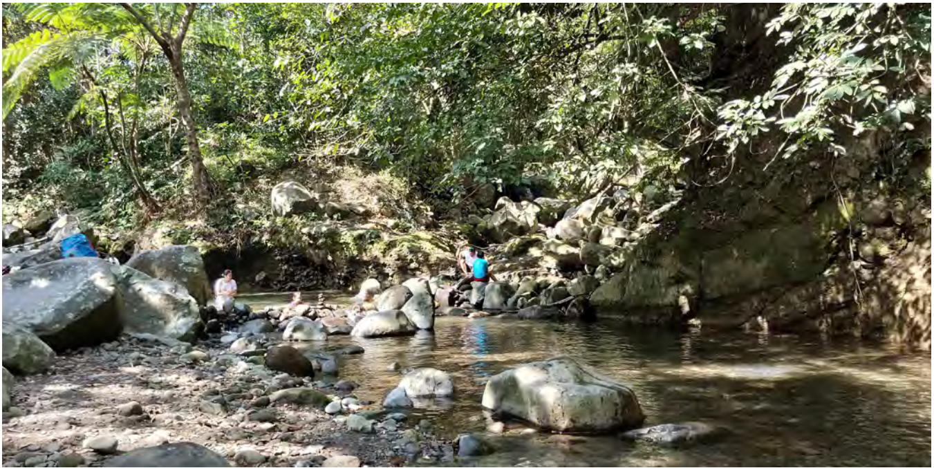
Fig. 6. Tala River in Brgy. Tala, Orani, Bataan. (UPLB Project Team 2020)

In 2018, 5,457 individuals visited the Ambon-ambon and Lumutan Falls, while 11,765 people went to Tala River, most of whom were locals. Tala River is popular among many locals and tourists for its clear, shallow waters and its 700-step trail that leads to the site.