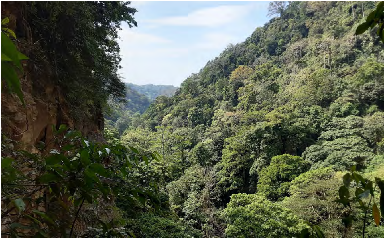
Fig. 3. Forest cover at the Ambon-ambon and Lumutan Falls. (BBMC 2021)